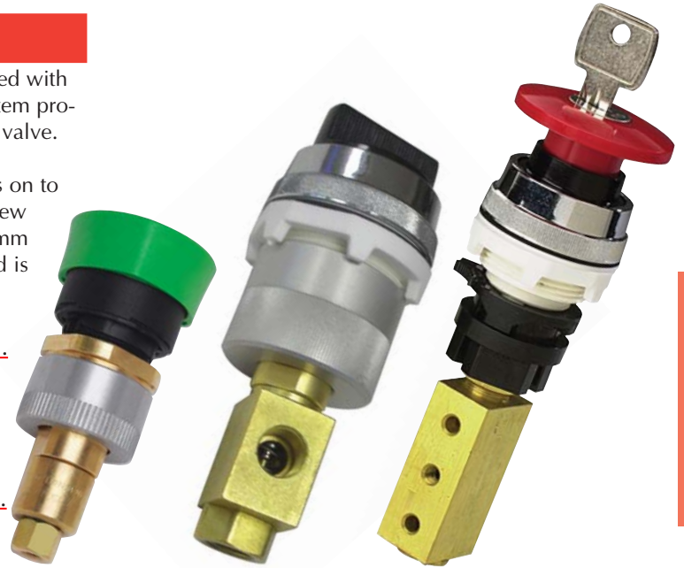
PB-22-X Adapter (22 mm) PB-30 Adapter (30 mm) PB-85 Adapter (30 mm)